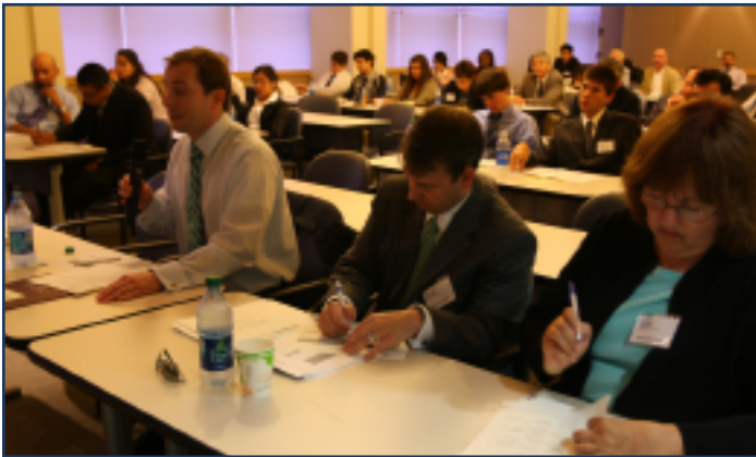
Hard Choices - Judges at the Capital Markets Contest evaluated the presenters before deciding on the top three teams.

Under a long-standing partnership with the California Council on Economic Education (CCEE), CFALA is a prime sponsor of the Capital Markets Contest, which focuses on economics and the stock market.